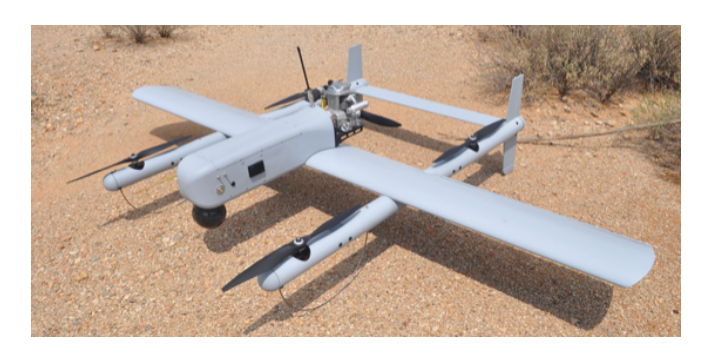
Picture 3: Hybrid UAV | Taken from: https://latitudeengineering.com/

Hybrid drones are a new but promising concept, as they are equipped with both wings and rotors which allow for vertical takeoff and landing (like the multirotor drone) as well horizontal flight like fixed-wing drones. This makes it possible to cover longer distances and carry heavier cargo than multi-rotor drones. Similar software applications are available for hybrid drones as for fixed-wing and multi-rotor drones.