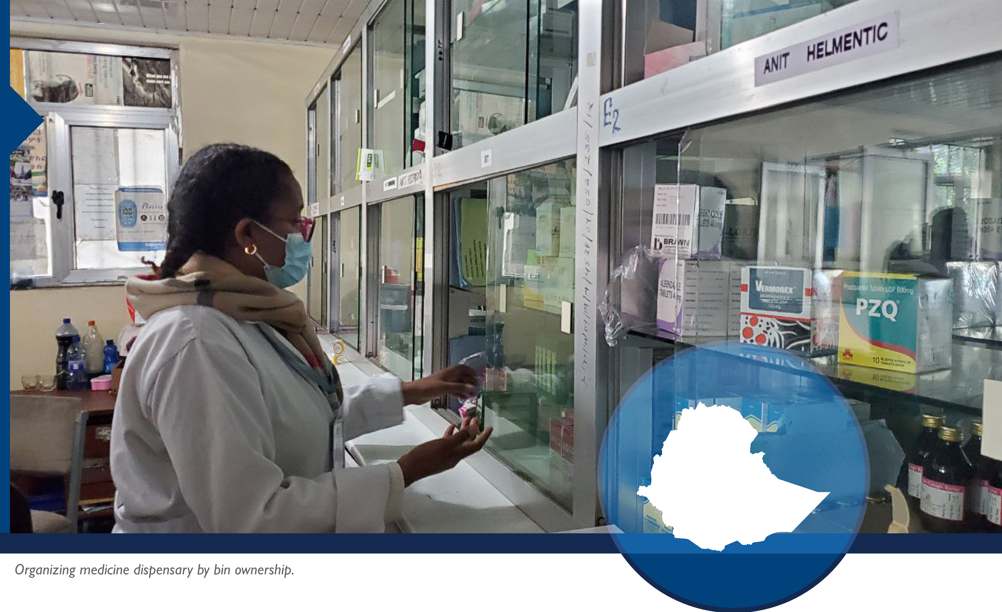
Organizing medicine dispensary by bin ownership.