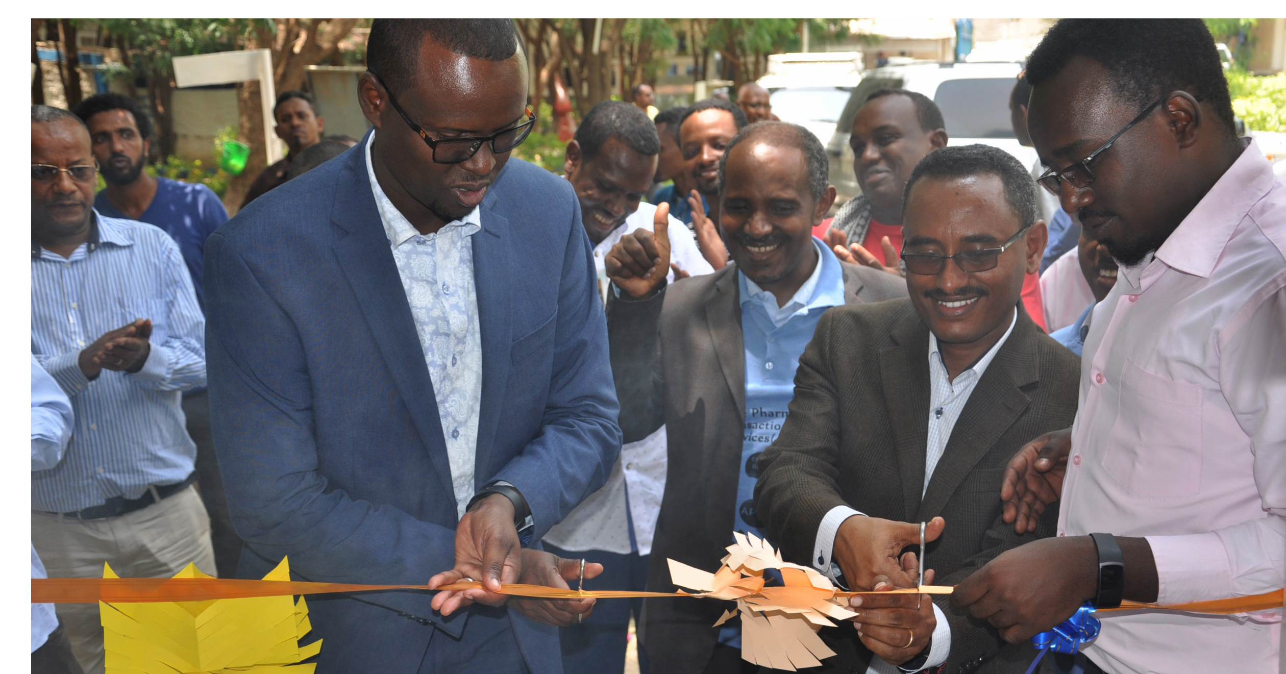
APTS inauguration at Dire Dawa.